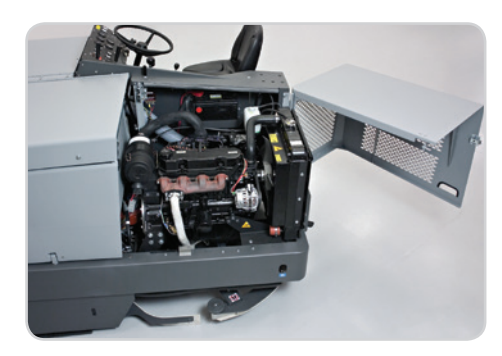
Maintenance is a breeze with easy-to-reach engine, electrical and hydraulic components.