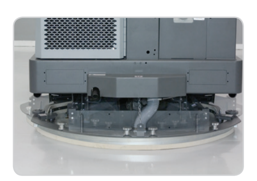
Patented Accu-Track™ squeegee provides superior water pick-up even during the tightest turns.