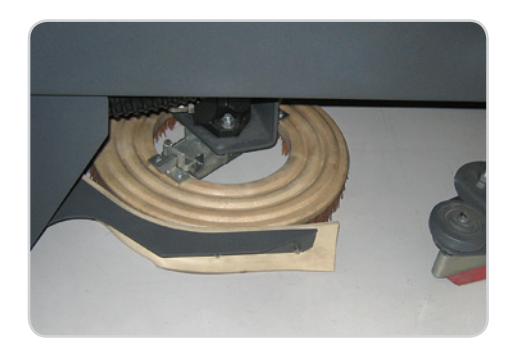
Scrub brushes with 600 pounds of downward pressure provide the most aggressive cleaning possible, yet brushes can be easily changed without tools.