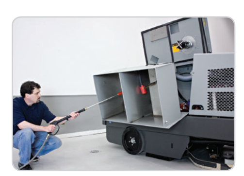
Recovery tank tilts out for quick and easy clean-up, reducing the amount of time needed for draining and refilling.