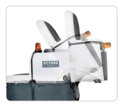
Recovery tank fully tiltable gives easy access to battery compartment and EcoFlex^{\text{TM}} System.