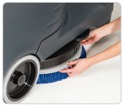
Tools-free removable brushes or pads.