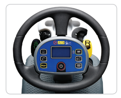
Extremely user friendly and easy to learn. Dashboard with One-Touch button and intuitive display integrated into the steering wheel.

Conventional automatic scrubbers tend to apply more water and cleaning solution on the floor than what is needed, especially when maneuvering around obstacles, slowing down on turns or cleaning along edges. SmartFlow™ technology eliminates extra solution dispensing by automatically reducing the solution flow rate when the machine is slowed down, extending the productivity per tankful. With larger tanks and less solution dispensed, operators will extend the time between dump and refill cycles by as much as 50%. The use of less solution with SmartFlow helps eliminate waste and more importantly, lessens the risk of slip and fall incidents within the facility.