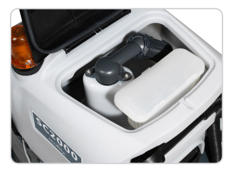
Flip-up lid and tilt-back tank provides easy access to the recovery tank, debris catch cage, batteries and EcoFlex™ cartridge.