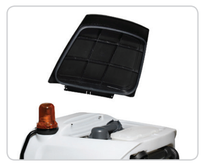
Easy to clean with recovery tank lid completely removable. (Shown with optional safety beacon light.)