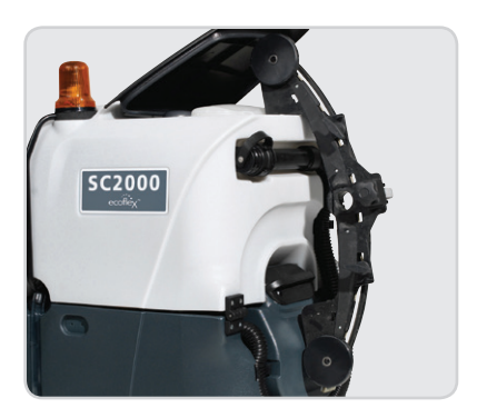
Built-in squeegee hanging system on tank allows for safe transportation through doorways and tight areas, while permitting tank drying.