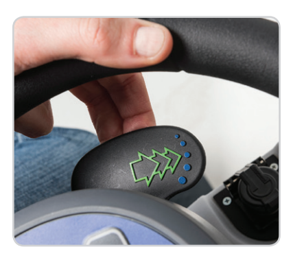
EcoFlex™ System allows for flexible detergent settings with a chemical free cleaning mode and burst of power for powerful spot cleaning at the touch of a button.