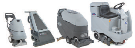
Designed with standards such as LEED-EB, GS-42 and CRI in mind, the AquaClean® 18FLX, CarpeTrier™ 28, Adphibian™ and AquaRide® floor machines demonstrate Advance's commitment to green cleaning.