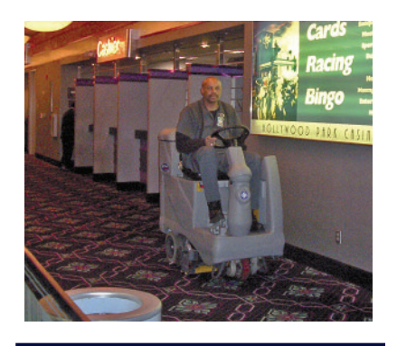
Operators easily maneuver the Advance AquaRide rider sweeper-extractor as they clean.

Advance floor-cleaning equipment is designed to increase productivity, while lowering the total cost to clean. From vacuums and carpet extractors to sweepers and ride-on scrubbers, Advance delivers efficient, easy-to-use equipment. To learn more about the Advance AquaRide and other Advance commercial cleaning Equipment, or to find a dealer near you, visit <u>www.advance-us.com</u> or call 800-850-5559.