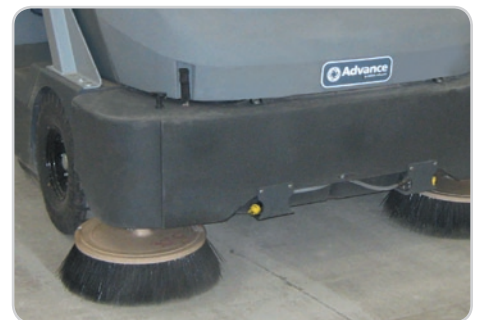
Sweeping with DustGuard™