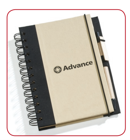
Spiral Notebook with Matching Pen

3 x 4 inch 50 sheet pads. Deliver your message and advertise your brand at the same time.