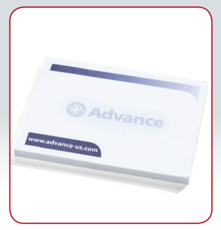
Post It Note Pads

Compatible with both Mac and PC. Expand any single USB port to host a number of computer accessories.