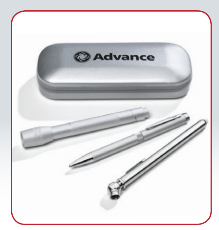
Roadster Gift Set