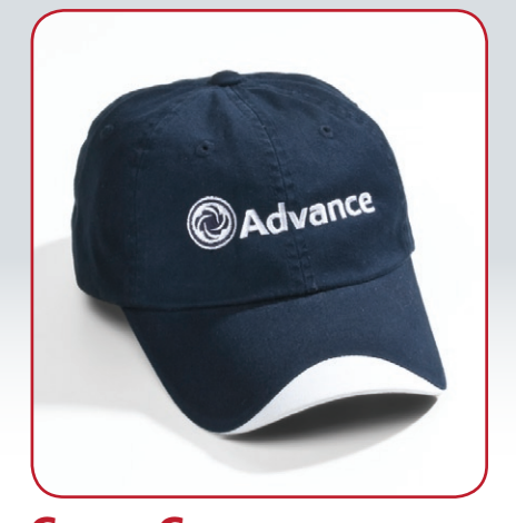
Curve Cap Item # 2245 100% cotton twill unstructured, low profile, 6 panel, self fabric adjustable closure with brass buckle. Contrasting curve design highlights the logo on the front.