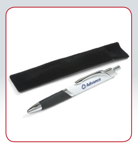
SoBe Metal Pen