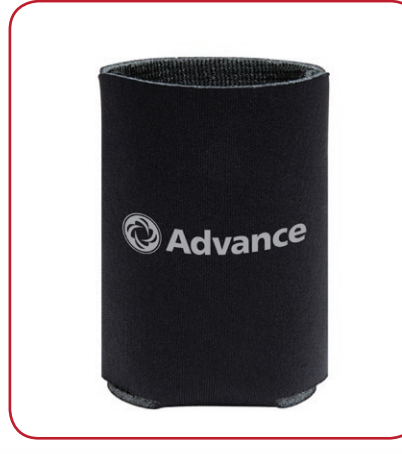
Eco Can Koozie

Eco-friendly design contains 2 pens, 2 pencils and a wooden sharpener. Perfect to take with you anywhere. Made from recycled paper.