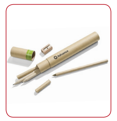
Ambrose Pen and Pencil Tube Set

Item # 1045 5 x 7 inch eco-friendly construction. Features elastic pen loop with matching recycled paper barrel pen. 80 page lines recycled paper.