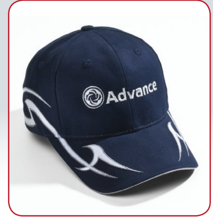
Flame Cap Item # 2240 100% brushed cotton twill. Structured, mid profile, 6 panel, hook and loop closure. Decorated with hot rod sickle flames for a sizzling look. Logo is on the front.