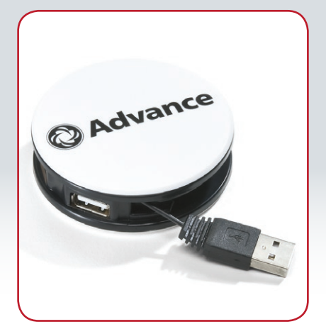
Four Port USB Hub

Stylish triangular shaped metal pen with Swiss nib and German black ink cartridge.