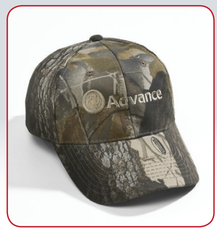
Camoflage Cap Item # 2235 Structured, mid profile, 6 panel with hook and loop closure. Features RealTree® hardwoods camouflage pattern. Logo is on the front.