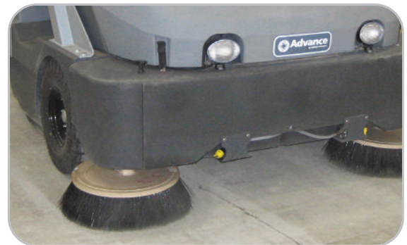
Sweeping with DustGuard™